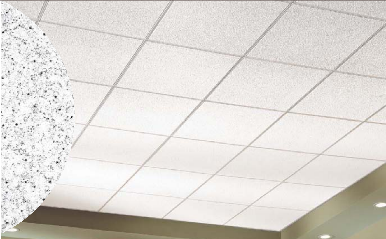
Cirrus High-NRC with Silhouette® 9/16" 1/4" reveal suspension system (Pg. 261)