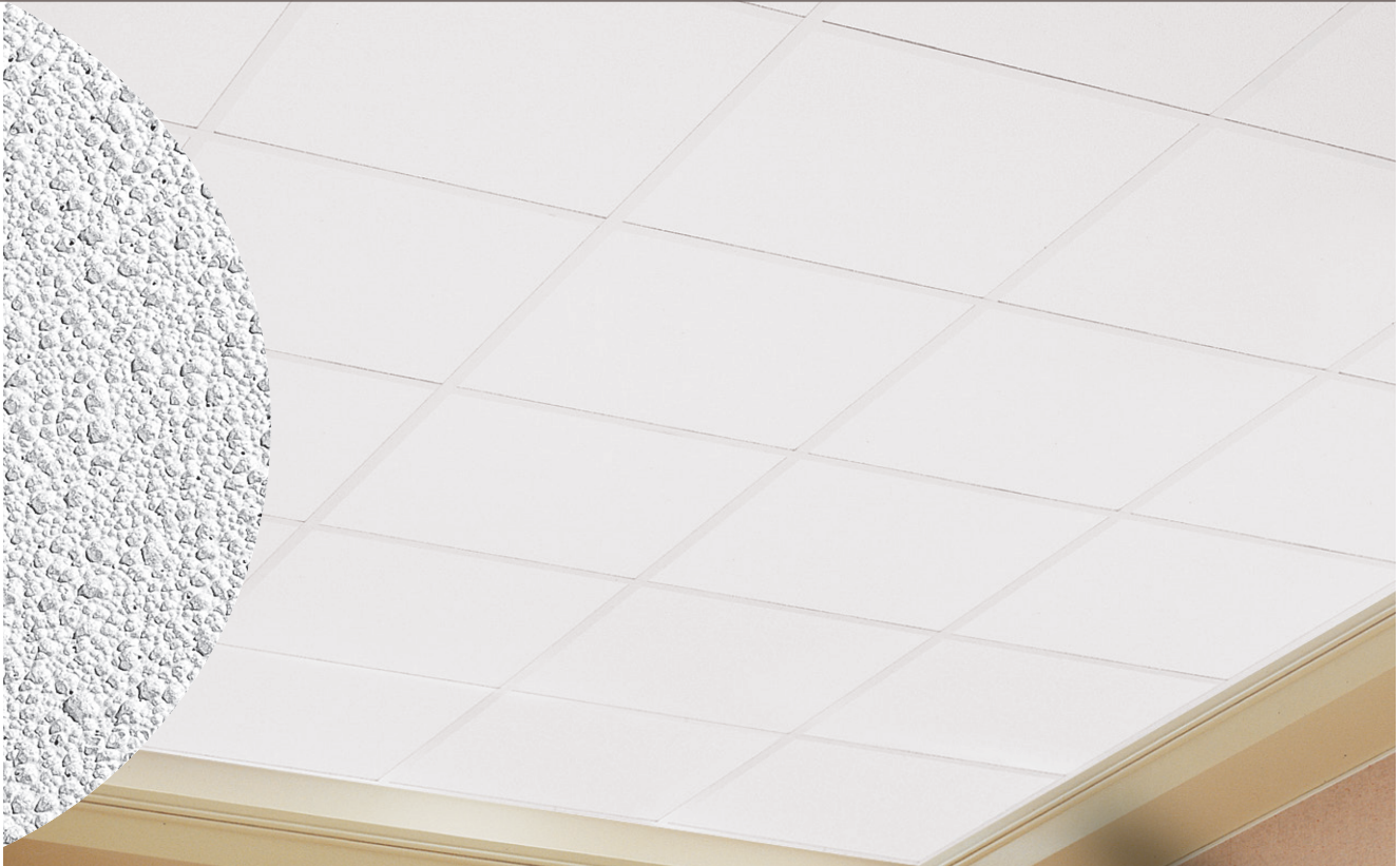
Pebble with Prelude® 15/16" suspension system (Pg. 259)