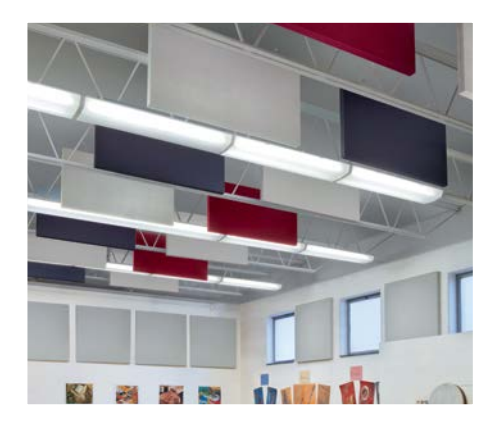
Soundsoak Baffles 24" x 48" in FR-701 fabrics; Custom Soundsoak Walls 42" x 42" in FR-701 Silver Papier fabric