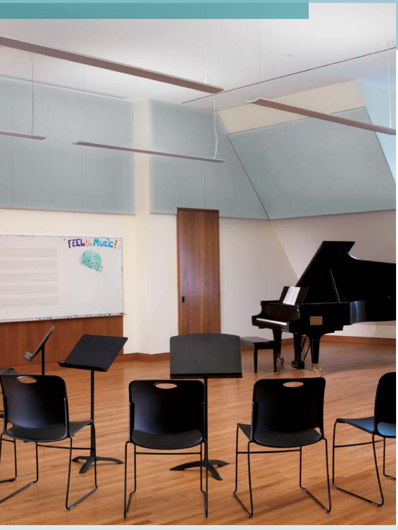
Soundsoak® Acoustical Wall System 24" x 72" panels in FR-701 Eucalyptus fabric