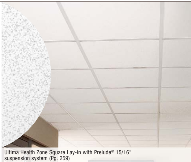
Ultima Health Zone Square Lay-in with Prelude® 15/16" suspension system (Pg. 259)